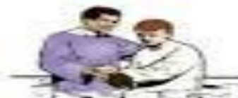
Crucified with Him