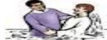
Raised with Him