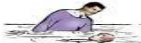
Buried with Him